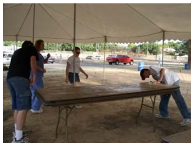
It takes a lot of preparation